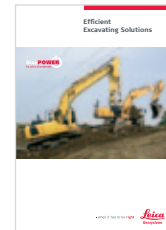
Leica Excavating Solutions Brochure