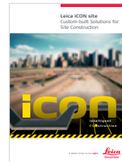
Leica iCON site Brochure