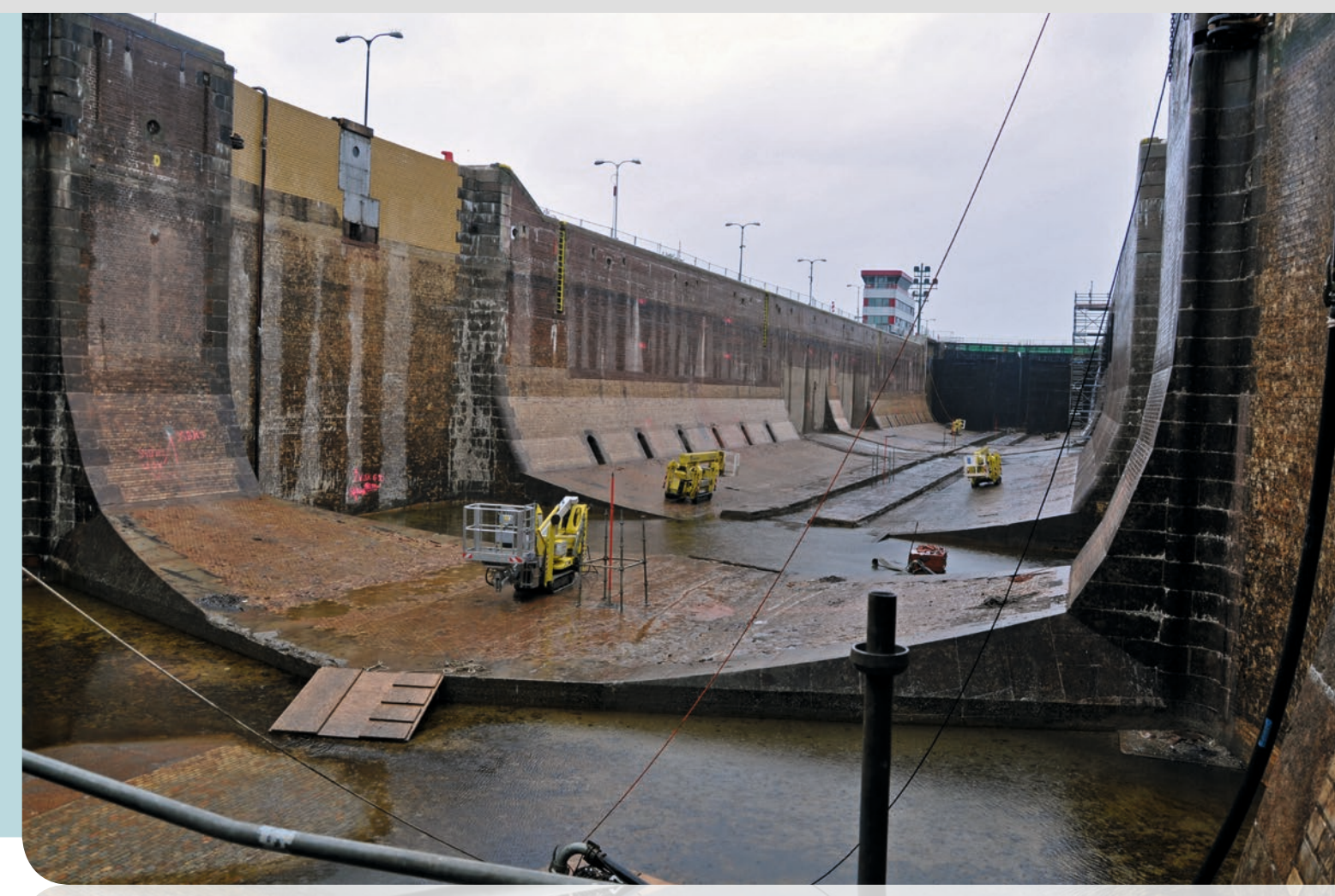
Ready for safe renovation: The empty ship lock gets inspected while the structure is being monitoring.

standard deviation tolerance of the points measure was \pm 2.2 milimetres ( \pm 0.09 inches) and controlled by Leica GeoMoS Monitor.