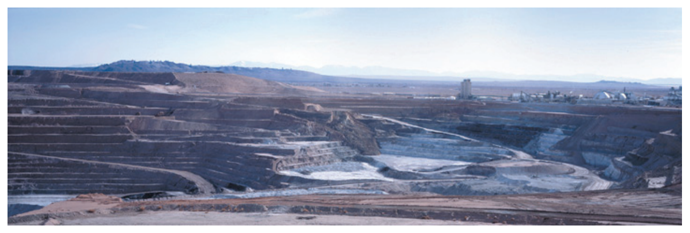
An overview of U.S. Borax's mine, located in the Mojave Desert near Boron, CA. The company developed a Leica global positioning system for machine guidance. This helps shovel operators navigate safely in potentially hazardous areas of the openpit..

S. Borax's mine in California's Mojave Desert is the source of nearly half the world's supply of refined borates. These minerals are used in hundreds of products, including essential plant nutrients that increase crop yield and quality, and safe building products that protect homes from insects and the elements.